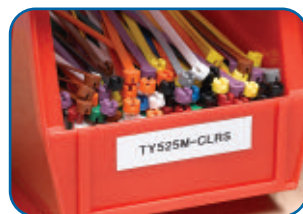
Great for General Labeling