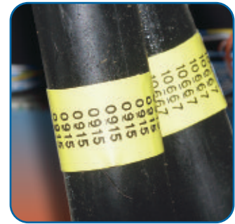
Perfect for Labeling Heavy Cables in Factory or Industrial Environments