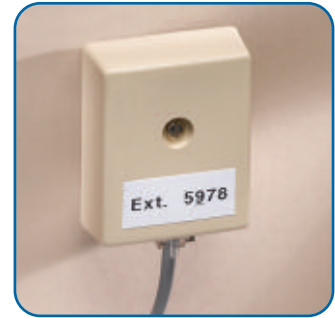
Great for Identification in Any Office or Industrial Setting