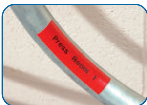
NEW! High-Visibility Indoor/Outdoor Vinyl Label