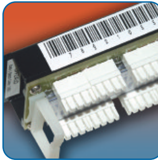
Easy Barcode Printing