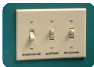
NEW! Clear, Professional, Seamless Labeling