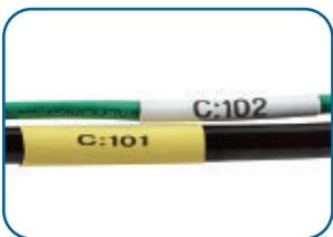
Ideal for Heat-Shrink Applications