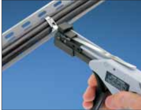
2. Use one of the PANDUIT® PAN-STEEL® installation tools to tension and cut off excess tail quickly.

The stainless steel metal locking tie series can be fastened by hand as shown in Photo 1 . No tools are required. Just place around bundle, pull the tip of the tail through the locking head and pull up tight by hand. The self-locking head secures the tie in place.