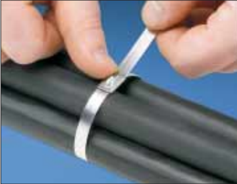
1. Place tie around bundle, put tip through head and pull up tight by hand.