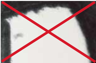
Cross sectional view of other manufacturer's tie body. (Photo micrograph shown is magnified 150X).