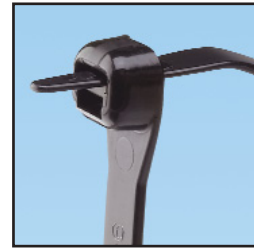
Tapered Tip with Aggressive Grips